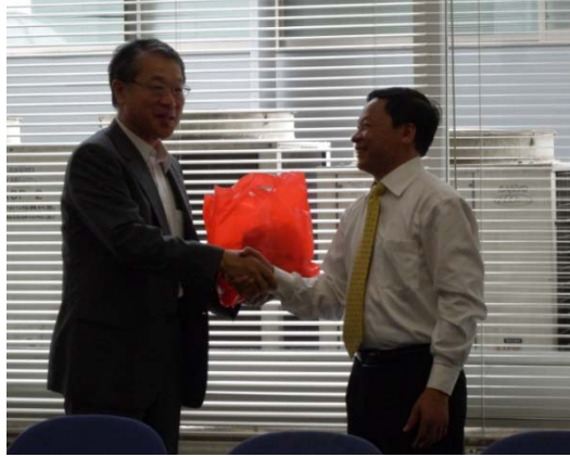
Courtesy call on director of River Bureau

It is also expected that the implementation of program help to raise awareness on the importance of flood management and on the necessity to advance adaptation measures. Finally in this November, the same training and dialogue program is planed targeting for Asian countries, which will be reported later.