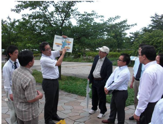
Field trip to Super Levees site of Edogawa city