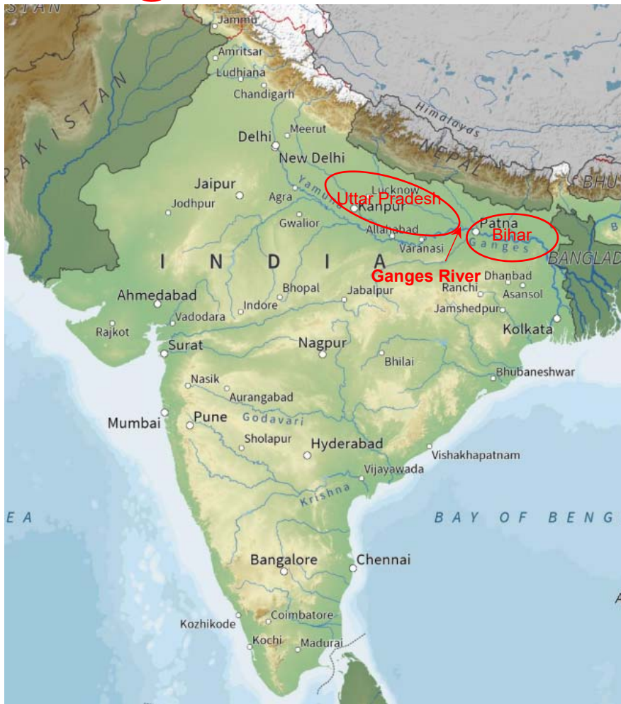
Map: mapswire https://mapswire.com/countries/india/