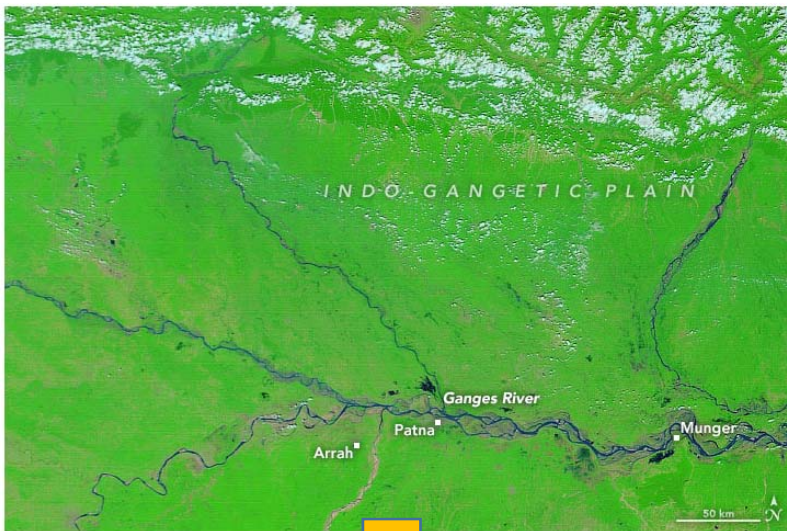
October 2, 2018