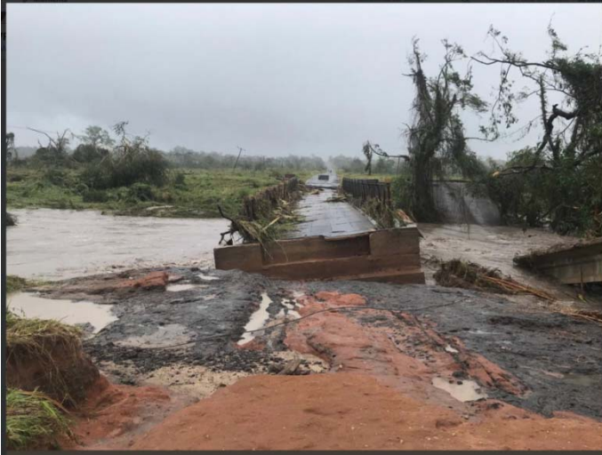
Muagamula Bridge of N380 in Mocomia, Cabo Delgado In Mozambique April 26, 2019