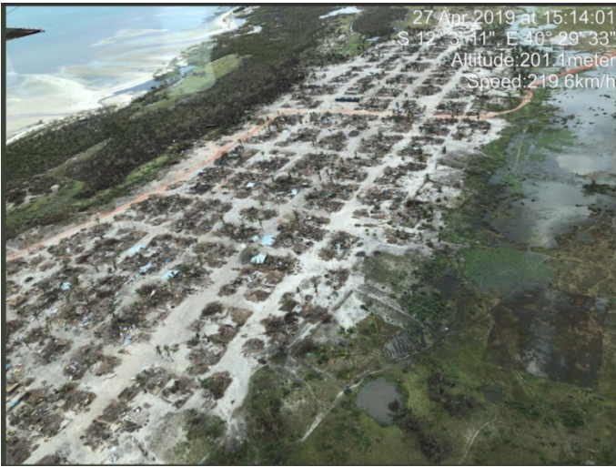
Coastal area of Mocomia, Cabo Delgado in Mozambique April 27, 2019