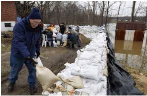
Volunteers create a wall of sandbags to protect homes from flooding after several days of heavy rain in Arnold, Missouri on Dec. 30, 2015