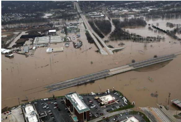
An aerial view from a Missouri National Guard UH-60 Black Hawk helicopter shows the effects of flooding in Pacific, Mo., Dec. 30, 2015.