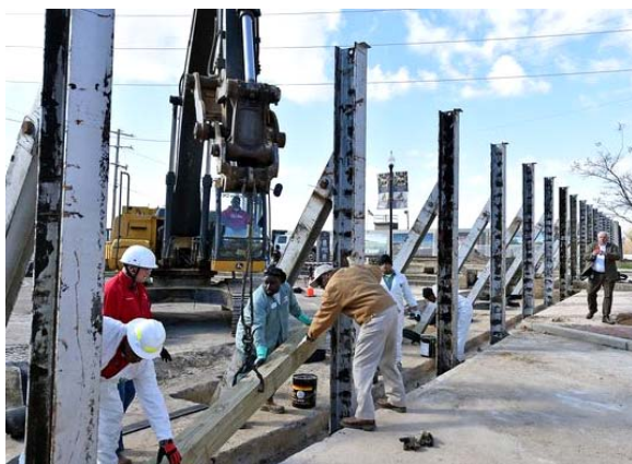
City of Vicksburg employees work on a floodwall Wednesday near the Old Depot Museum on Levee Street in Vicksburg as the Mississippi River continues to rise. Jan.6, 2016