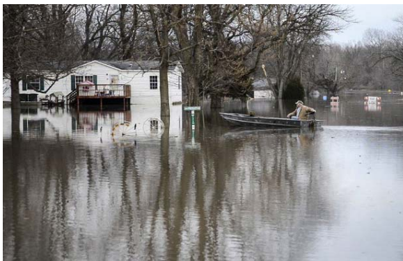
A resident rides his boat through flood waters to check on his home in Commerce, Mo., Dec. 31, 2015.