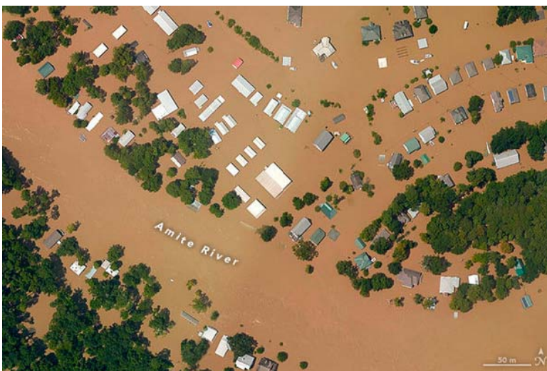
Port Vincent and Amite River August 14, 2016 (NOAA)

Source: http://www.nola.com/weather/index.ssf/2016/08/nasa_noaa_university_views_of.html