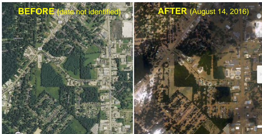
Amite River broke a record high level of 46.2 feet (14.1m) Denham Springs August, 14, 2016

Source: http://www.nola.com/weather/index.ssf/2016/08/nasa_noaa_university_views_of.html