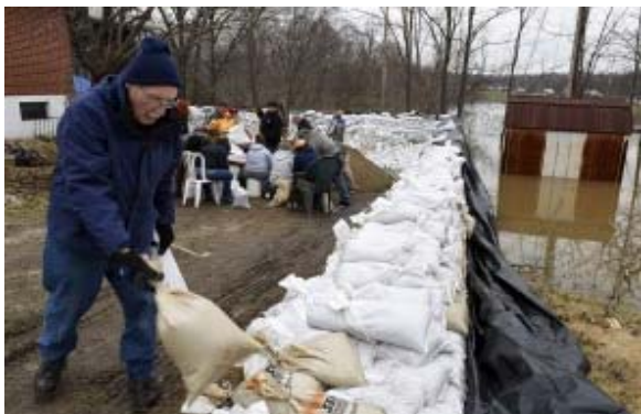
Volunteers create a wall of sandbags to protect homes from flooding after several days of heavy rain in Arnold, Missouri on Dec. 30, 2015