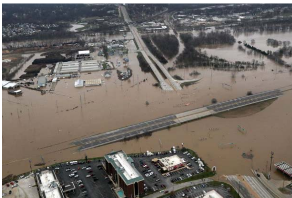
An aerial view from a Missouri National Guard UH-60 Black Hawk helicopter shows the effects of flooding in Pacific, Mo., Dec. 30, 2015.